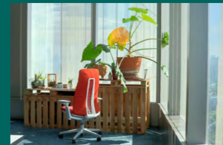
Manila, the Philippines