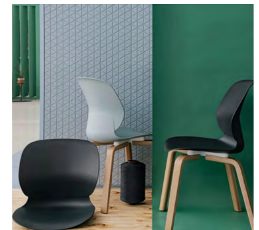
Maari with the recycled shell (Europe)